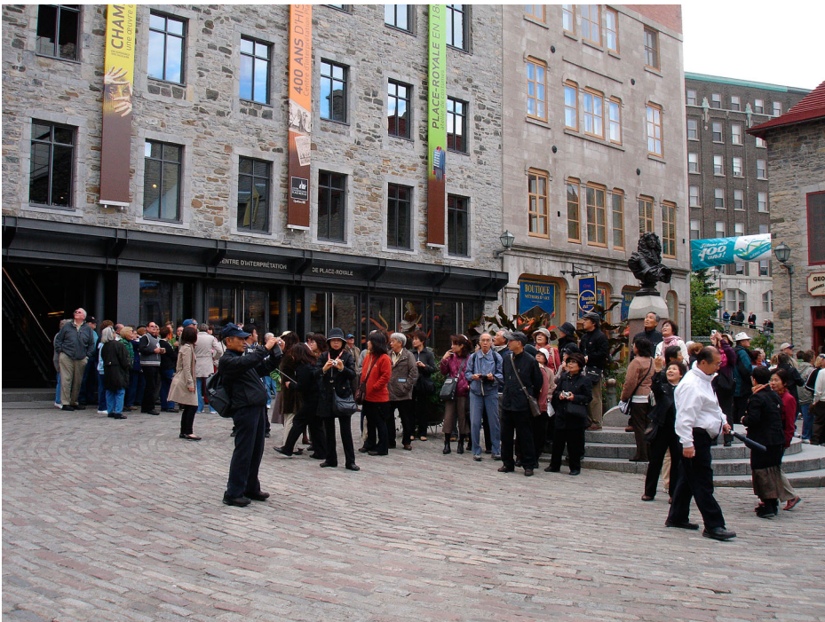
Figure 4. The old town of Quebec in Canada, a World Heritage Site, is largely rebuilt but still provides enjoyment and a historic town experience to the thousands of tourists that visit each year.

approach to its minorities. Much of this activity is being carried out in the name of conservation or as an act of conservation. It could be argued that Frampton's critical regionalism is meeting Eco's hyper-reality. What is obvious is that the value of the 'truth' in the case of architectural heritage is disappearing.