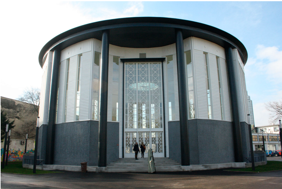
Figure 3. The restored French Pavilion in Zagreb, Croatia where the conservation of the early twentieth-century building considered its design integrity to be of greater value than some its poorly performing material elements.

This shift in methodology linked to values-based approaches has also instigated discussions on the power of the present-day public to determine what is kept and what is demolished. In an example cited by Schmidt, 42 a German publicist on behalf of the Green party advocates the de-Nationalisation of heritage proposing a direct public say in what is kept, so that heritage with negative connotations [in the present day] or buildings that are 'ugly'